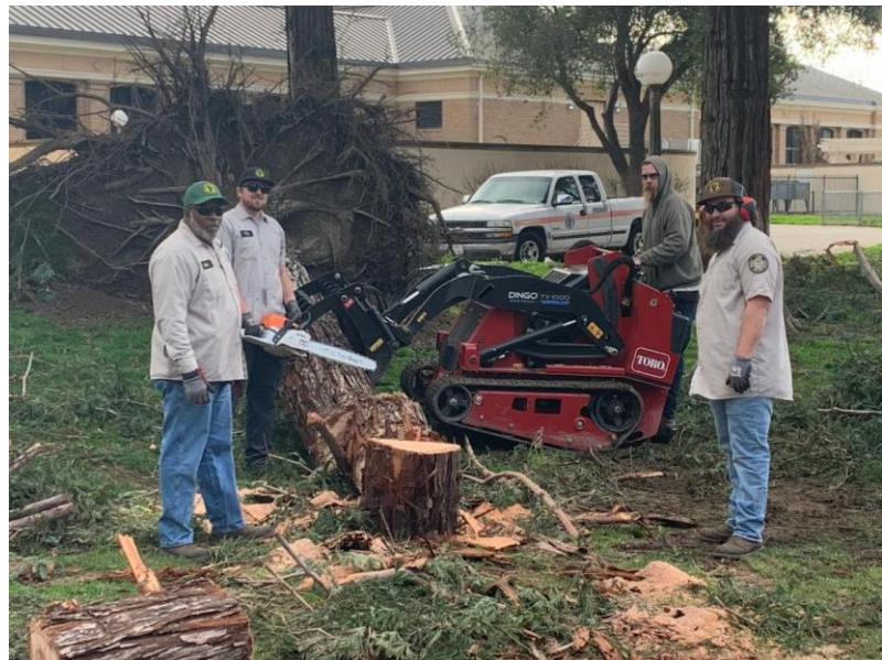
City crew cleans up fallen redwood at Hutchins Street Square

The past month has been a busy one for many of us, particularly those who've suffered through the numerous winter storms and the post event clean-up. Our City of Lodi public works crew, firefighters, police, and parks personnel have been working round the clock to clear streets, get power back on, and relieve flooding in neighborhoods around the city. I've requested regular updates from our City Manager as to the status of the clean-up, power outages, trees down, the number of residential properties destroyed, and when our city parks will be open again. Our city parks lost over 100 large trees and all parks remain closed until we can assess impacts from this coming weekend's forecasted weather. The City is continuing to work overtime to clear streets, ensure drainage basins and storm drains are clear, and reopen our public parks for residents. I'll be providing a status at the January Constiuent meeting at LOEL Center. If you have any continuing difficulties regarding the recent storms, please contact me at lcraig@lodi.com .