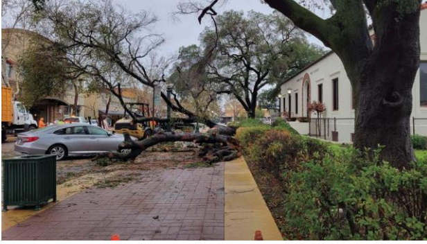
Tree blocks School St.

The extreme weather in the Lodi area this month has increased the risk of car accidents and property damage from high winds and flooding. Before traveling, check road conditions. If you've experienced property damage, you can assist San Joaquin County Office of Emergency Services and support our city and county efforts to